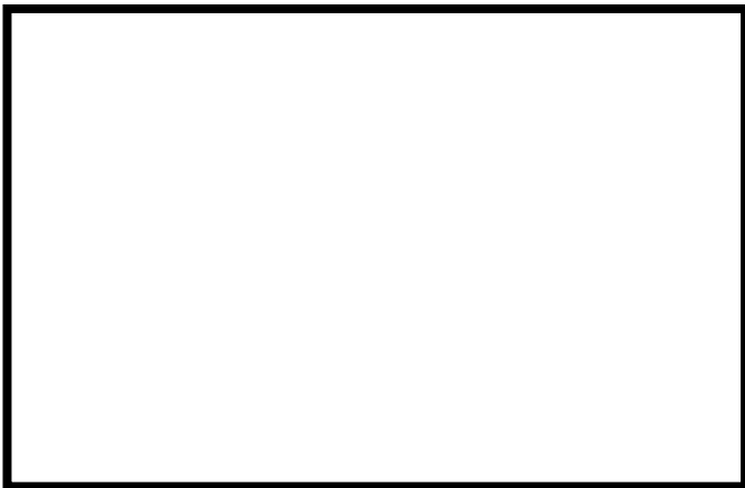
Seas: Seas are large bodies of salt water that is often connected to an ocean.. A sea may be partly or completely surrounded by land.