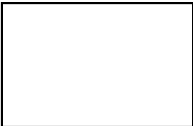
Streams: Streams are small, flowing bodies of fresh water that flow into rivers.