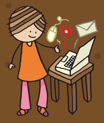
PARENTS: Visit us at bonniecabbageprogram.com to watch the parent video and to show your child the student video.

Submissions MUST BE turned in to your 3rd grade teacher no later than September 20, even if you've moved on to the 4th grade. You're still eligible to win!